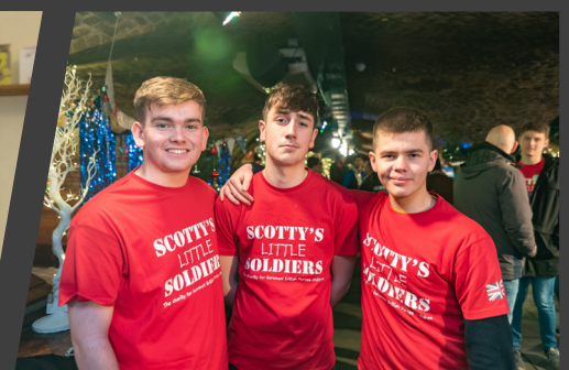
PEER TO PEER SUPPORT