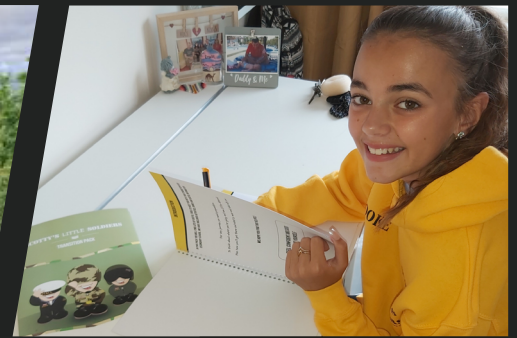
SCHOOL TRANSITION SUPPORT