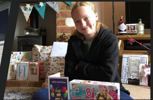
GIFTS AND VOUCHERS