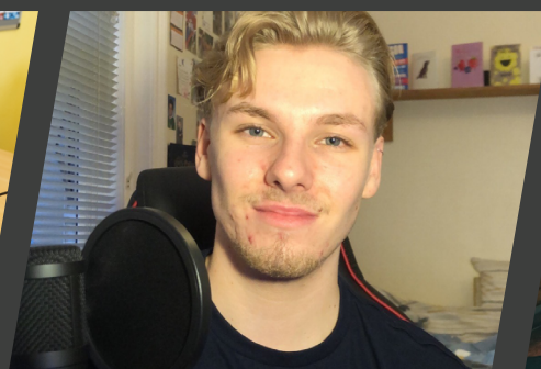
SPRINGBOARD PODCAST SERIES