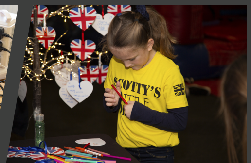
BEREAVEMENT RESOURCES AND GUIDANCE