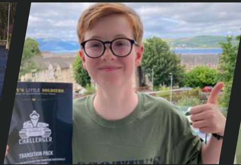
SCHOOL YEAR GROUPS